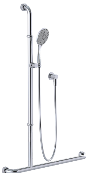
Drawn LH (Left Hand)